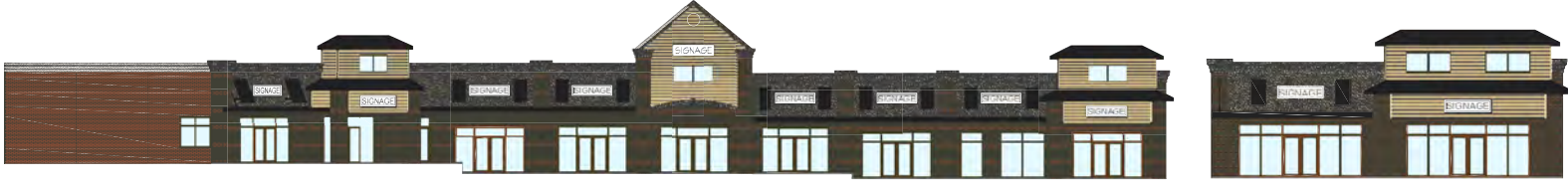
FRONT ELEVATION - BUILDING 'A'